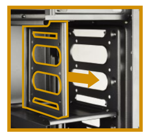
Removable 2.5" SSD bracket to fit longer VGA card