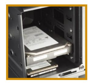
One extra 2.5" SSD space at bottom