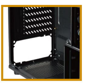
Bottom mounted PSU slot