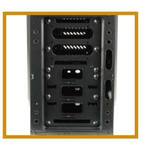
Dual front fan slots for super cooling